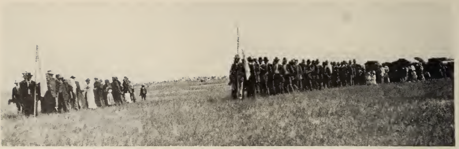
Groups ready to march to service